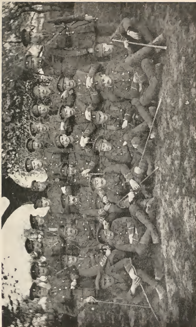
OFFICERS OF THE 2ND BATTALION ROYAL MUNSTER FUSILIERS, MAY 1915