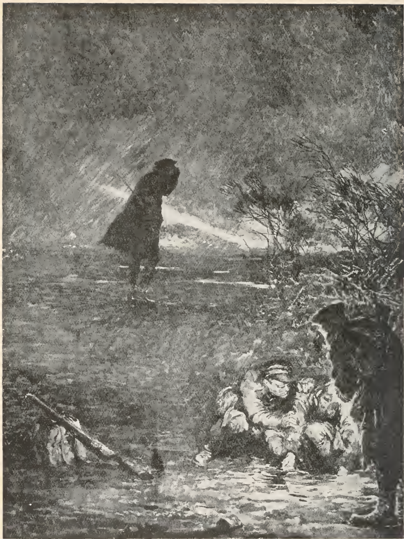
THE MUNSTERS AT FESTUBERT December 22nd, 1914