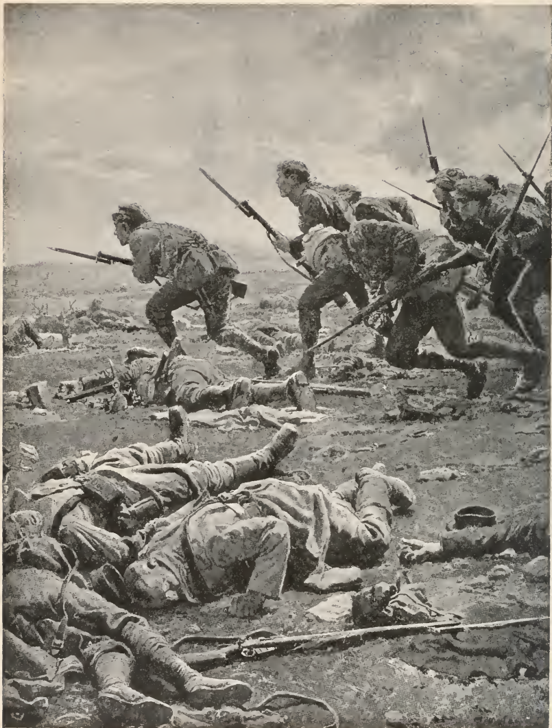
THE MUNSTERS AT HULLOCH September 25th, 1915