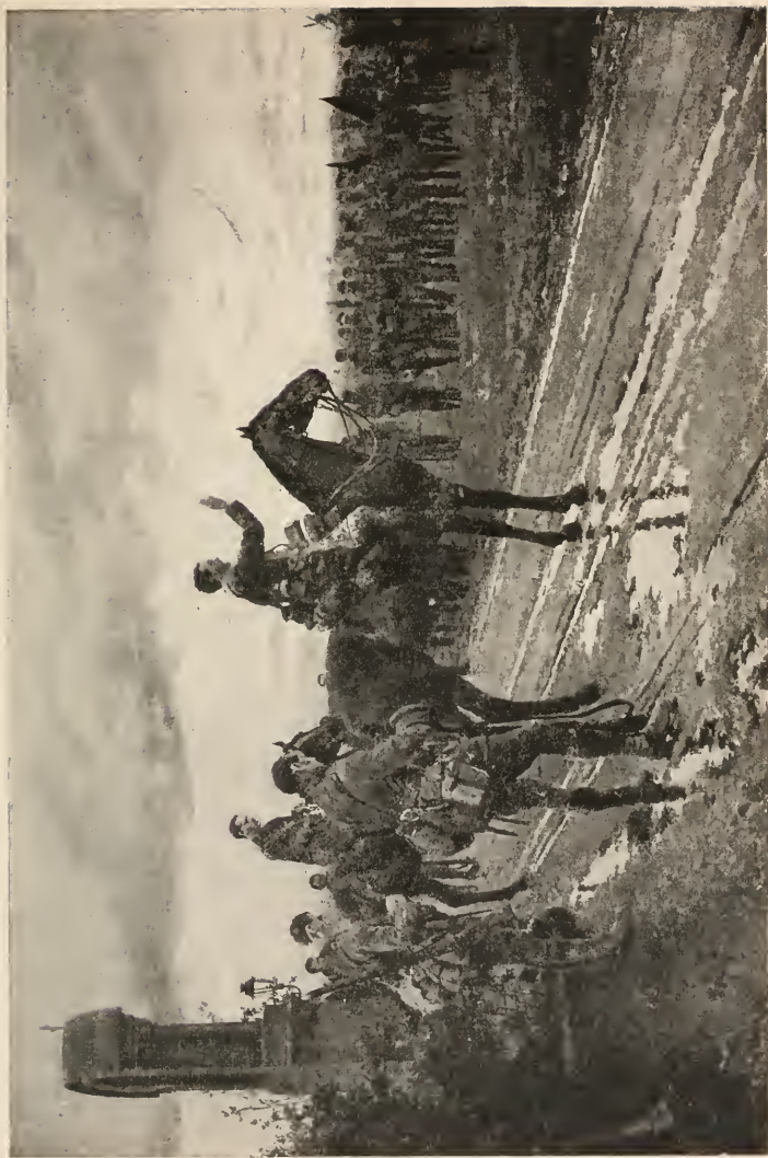
THE LAST ABSOLUTION OF THE MUNSTERS AT RUE DU BOIS, MAY 8TH, 1915