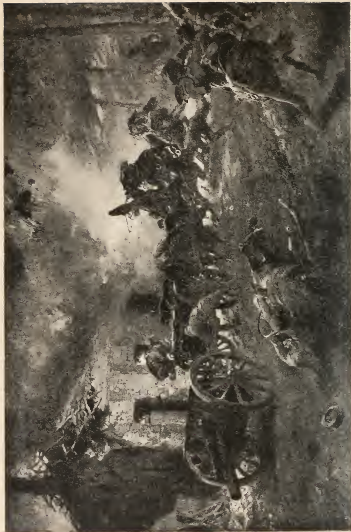
THE MUNSTERS AT ETREUX, AUGUST 27TH, 1914